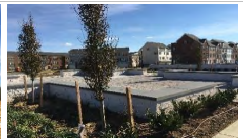
The Westphalia Green is expected for completion in summer 2019.