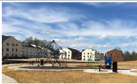
The Playground equipment has been installed near the Westphalia Green Circle.