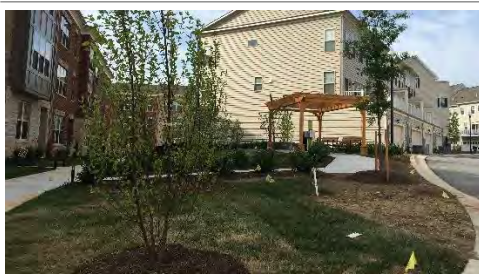
The Pergola located near Eastland Circle has been constructed.