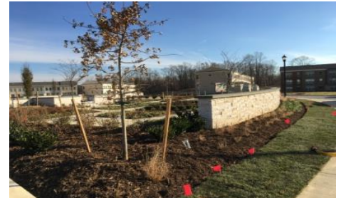
The Westphalia Green Park is expected to be completed in early 2019.