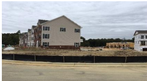
Townhome lot nearing completion for one of three featured builders.