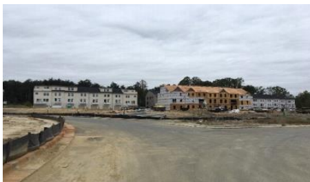
Ongoing construction of townhome lots.